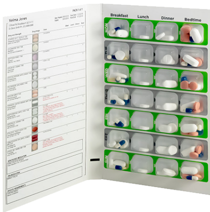
Bubble/Blister Pack (Preferred) is packaged by a pharmacist.

In an effort to reduce possible errors in medicine administration, we require all campers to arrive at camp with pre-packaged medications. This means that all medications, vitamins and supplements brought to camp must be prepared and remain in a multi-dose or medication cassette for the duration of their stay. It is preferred that this is done in a “bubble pack” by a pharmacist as shown below.